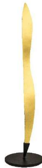
Metamorphosis 2020 25,50 x 17 x 17 cm Mahogany root with gold leaf