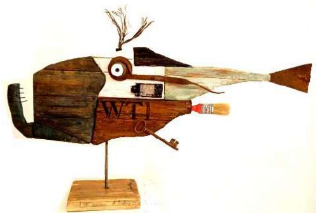
pez carpa 2019 70 x 30 cm Painted wooden sculpture and other recycled materials.