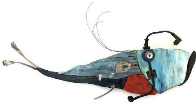
bacallà 2019 70 x 30 cm Painted wooden sculpture and other recycled materials.