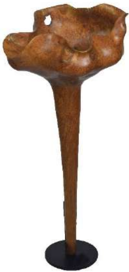
Loto 2019 94 x 41 x 32 cm Teak root.

The Ingravidesa Sculpture Alliance is an international group of sculptors and designers who collaborate to create abstract sculpture with nature literally at its roots! They work together for months on monumental projects based on collaborations where each artist is invited to assist in the creative process. Time is split between Asia, where discarded tree roots are sustainably sourced and prepared, and the studios in Catalonia and Holland where the recycled wood pieces are further worked on and sometimes layered with gold leaf and other precious metals.