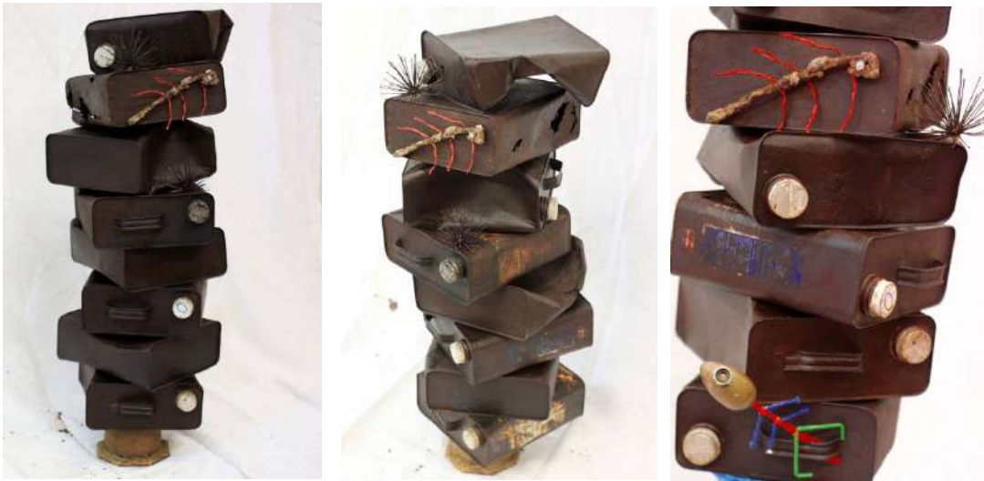
Mar endins 2020 100 x 30 x 15 cm Recycled iron.